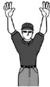
C. Time-Out, Foul Ball or Dead Ball