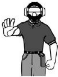
A. Do Not Pitch