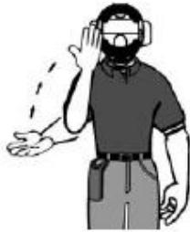
B. Play Ball