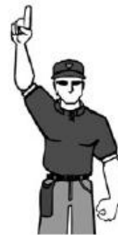
F. Infield Fly