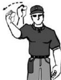
E. Strike or Out