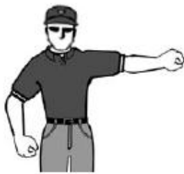
D. Delayed Dead Ball