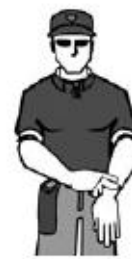
K. Time Play